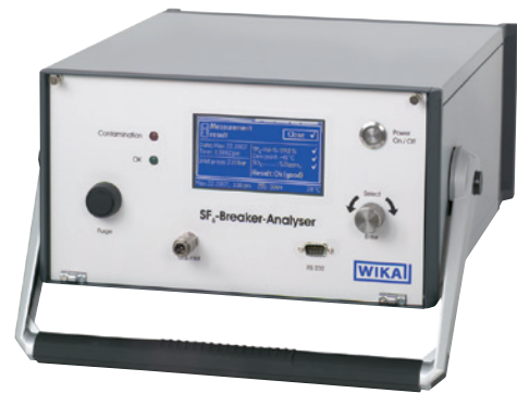
Analysis instrument, model GA10