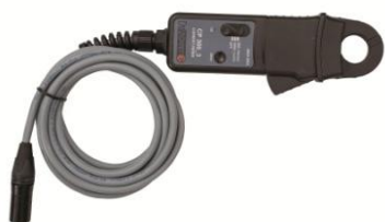
Current clamp 30/300 A with extension 5 m (16.4 ft)