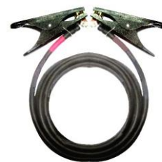
Current connection cable