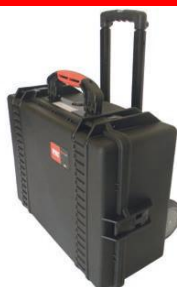
Cable plastic case with wheels