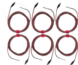
Temperature probes 6 x 50 mm (1.97 in) + 5 m (16.4 ft) cable set