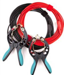
Voltage Sense cables with TTA clamps