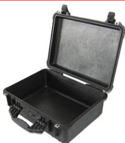
Cable plastic case