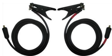
Current cables with battery clamps