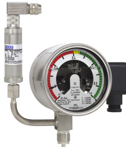
Gas density monitor with attached transmitter, model GDM-100-TA